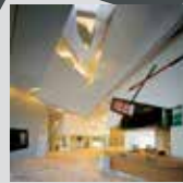
The Ian Potter Centre NGV Australia