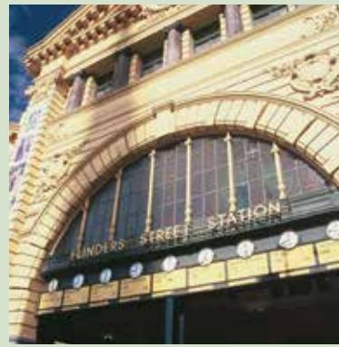
Under the clocks at Flinders Street Station

Step up to Centre Way ⑦ (1913) - an early steel-framed building with a post-modern makeover - then cross Collins Street and turn left before entering the exquisite 19th century Block Arcade ⑧. The arcade was named after the fashionable Collins Street block between Swanston and Elizabeth Streets where 19th century Melburnians liked to promenade or 'do the block'. Today, it is still a hive of activity, with its mosaic floors and fascinating shops to explore.