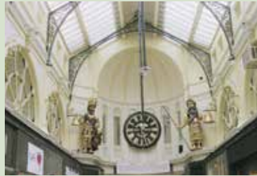
Gog and Magog