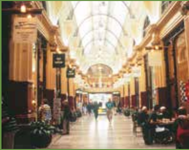
The famous Block Arcade

Reaching Melbourne's shopping heart at Bourke Street Mall (12), turn left and cross the Bourke Street Mall, pass the sculpture the Public Purse (13) outside Melbourne's GPO , then continue along Elizabeth Street. The Underground Public Toilets (14) are historic: the men's were built in 1910, while the ladies waited longer, until 1927.