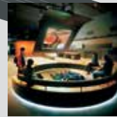
Australian Centre for the Moving Image