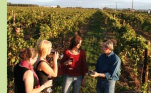
Coonawarra Wine Region