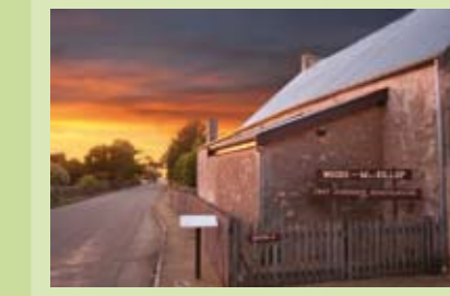
Woods MacKillop Schoolhouse