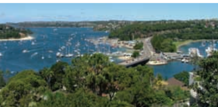
Middle Harbour and the Spit Bridge