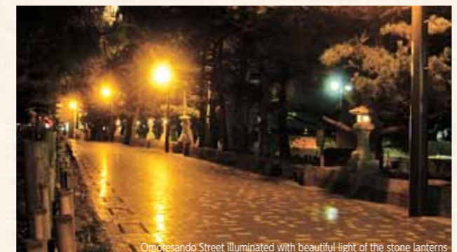
Omotetsando Street illuminated with beautiful light of the stone lanterns

You can make many discoveries.... It is definitely fun to try finding these things in Futami!